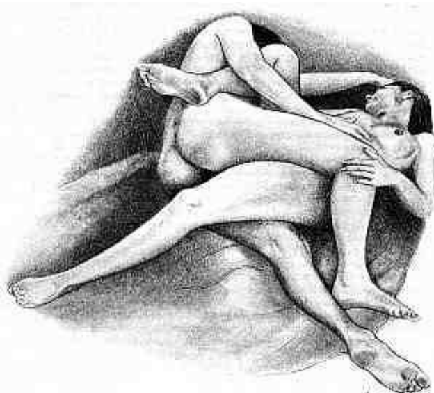
Figure 3: Scissor Position

Initially and also if there is a problem with erection or natural lubrication or premature ejaculation, both partners may remain more or less motionless in this position for about half an hour. During this time the tip of the penis, whether soft or hard, remains outside, just touching the inner entrance of the vagina.