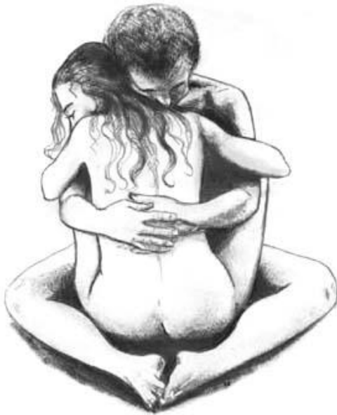
Figure 2: Sitting Position

Then use the breath to draw the sexual energy up the spine and into the brain to activate the crown chakra and then the forehead chakra. After this you may activate the other chakras one by one or just circulate the energy with each breath around the microcosmic orbit as described in Chapter 2. Finally you may for a longer time breathe into the heart chakra and during exhalation send out a loving feeling to envelop both of you.